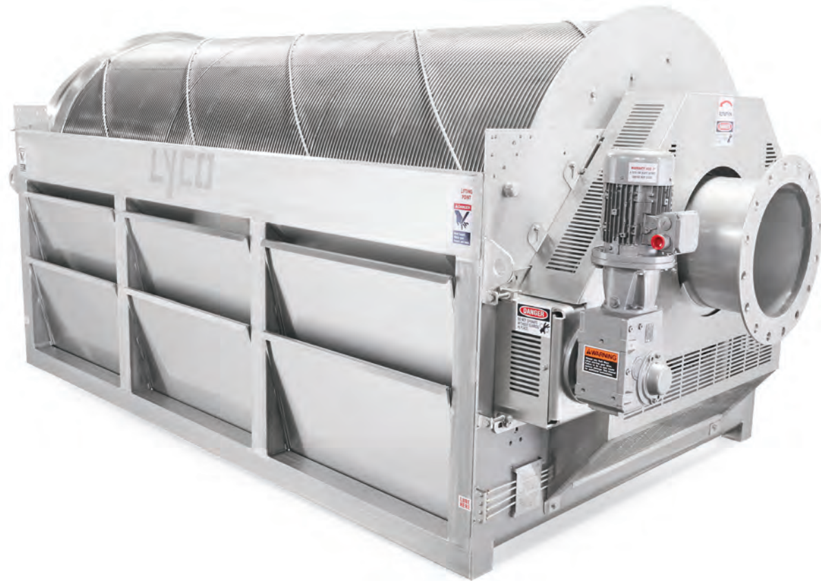
60 in. (1.52 m) x 126 in. (3.2 m) Lyco Single Drum Screen

Our mission is to develop machinery that will help solve our customers problems.