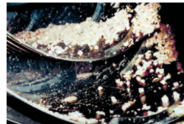
DOUBLE DRUM SCREEN ACTION

Wedge-Wire Screens, Travelling Sprays, and Never-Fail Running Rings make these the most effective and reliable screens made.