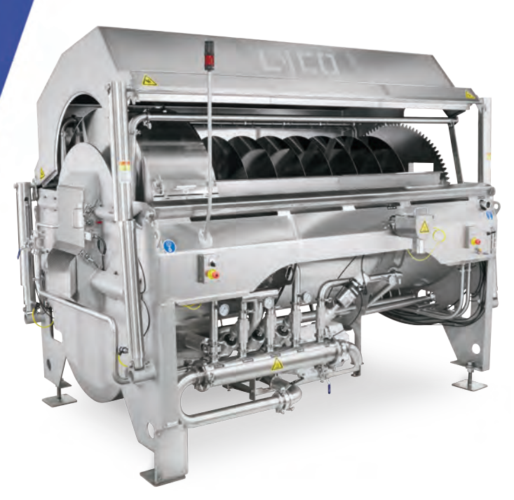
40 in. (1.02 m) x 7 ft. (2.13 m) Continuous Clean-Flow® Cooker