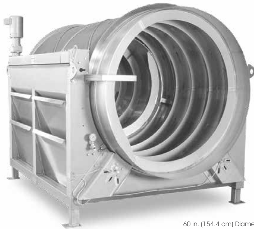
60 in. (154.4 cm) Diameter x 84 in. (203.2 cm) Long Cylinder

THE EFFICIENCY OF SOLIDS REMOVAL SCREENING TWICE IN ONE MACHINE IS IMPORTANT. 450 satisfied, repeat customers of our Rotary Drum Waste Water Screens, attests to the value of our designs.