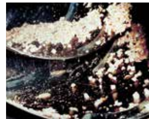
This photo of diced potatoes shows how the inner .080 in. screen retains larger particles so the .020 in. outer screen can operate more efficiently with less loading.