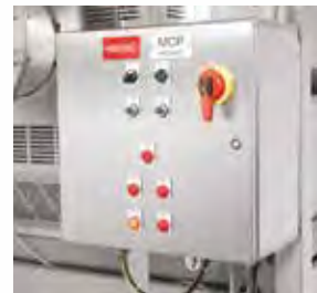
LOCAL PANEL WITH LIGHTS

Located at each trunnion is a sensor. If the sensor is not detected or running, a light on the main panel will indicate which trunnion is not rotating. The chain also has a sensor, if the chain is not detected within normally operating condition, a light on the panel will indicate it's not tightened to the proper tension