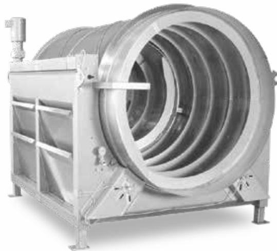
60 in. (154.4 cm) Diameter x 84 in. (203.2 cm) Long Cylinder

More than 1,300 satisfied, repeat customers of Lyco's wastewater screens enjoy the proven efficiency of this double-screen process in one machine.