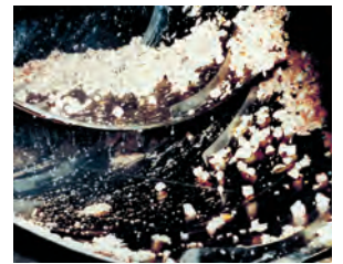
This photo of diced potatoes shows how the inner .080 in screen retains larger particles so the .020 in outer screen can operate more efficiently with less loading.