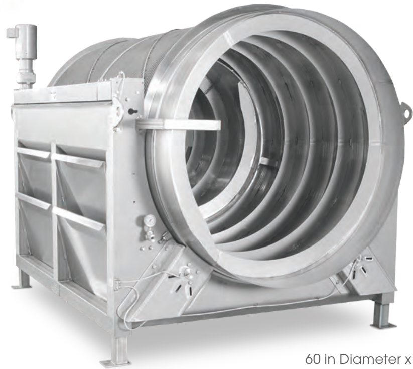
60 in Diameter x 84 in Long Cylinder

The efficiency of solids removal screening twice in one machine is important. 450 satisfied, repeat customers of our Rotary Drum Waste Water Screens, attests to the value of our designs.