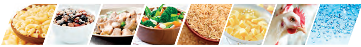
PASTA DRY BEANS PROTEINS VEGETABLES RICE POTATOES MEAT PROCESSING WASTEWATER