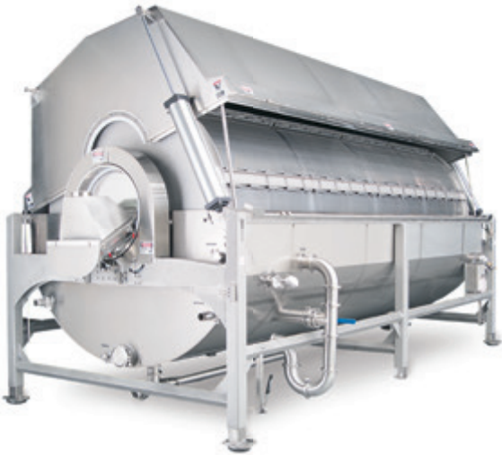
60 in. (154.4 cm) Diameter x 16 ft. (4.88 m) Long Vapor-Flow® Steam Blancher

IN 1999, LYCO DEVELOPED AND PATENTED THE FIRST ROTARY DRUM STEAM BLANCHER.