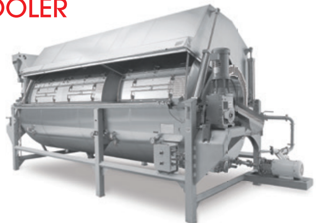
60 in. (154.4 cm) Diameter x 8 ft. (2.44 m) / 4 ft. (1.23m) Cooker Cooler