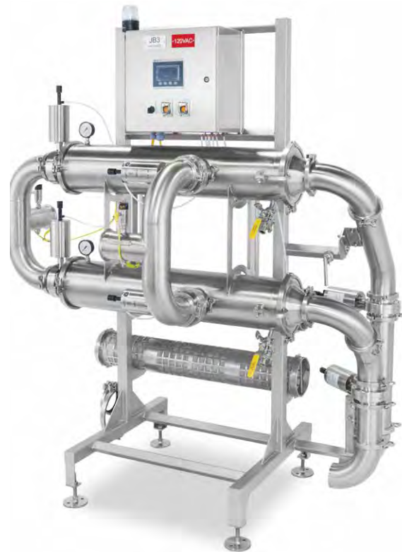
8-in Fully-Automated System